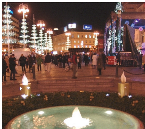
Night life in Zagreb Croatia