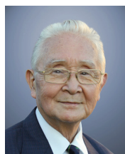
Thomas T. Noguchi WAML President

With the end of the year approaching, I would like to wish all of you and your families, good health and a Happy New Year. We look forward to having another good year of activities.