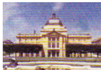
18th World Congress on Medical Law