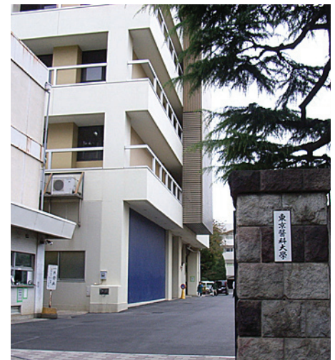
Tokyo Medical University